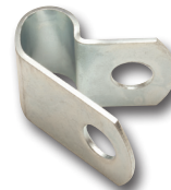
Steel cable clamp 8949 - .25 dia. 8950 - .312 dia