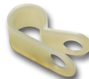
Nylon cable clamp 86381 - .25 dia 7412 - .312 dia.